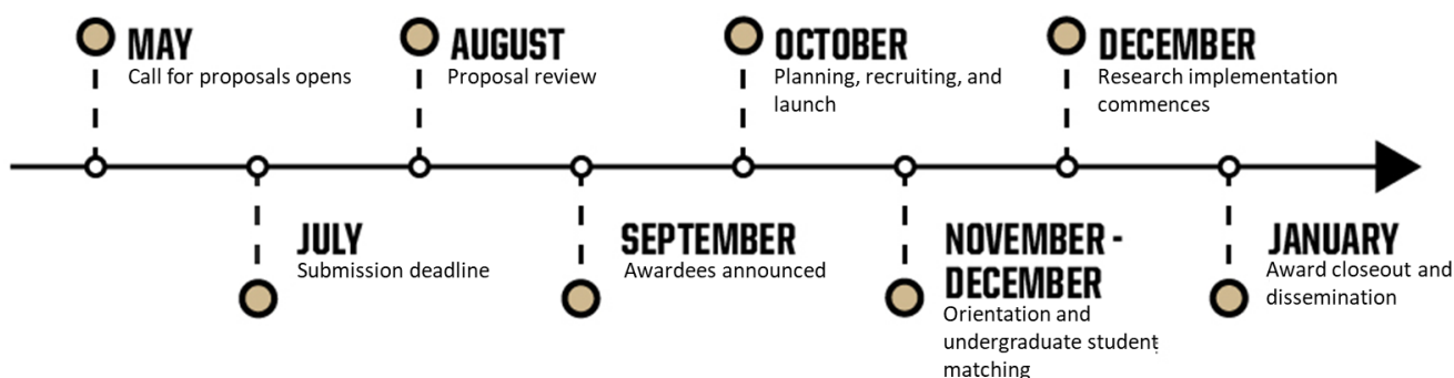
Figure 1: Award Timeline